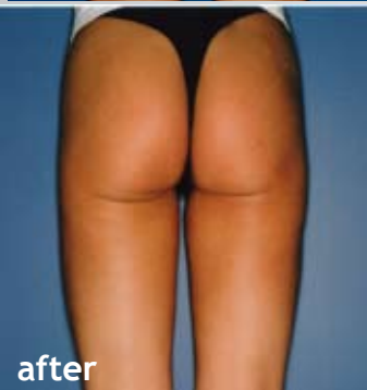
A more natural looking result!

Smartlipo is available at the following Bioscor Clinic